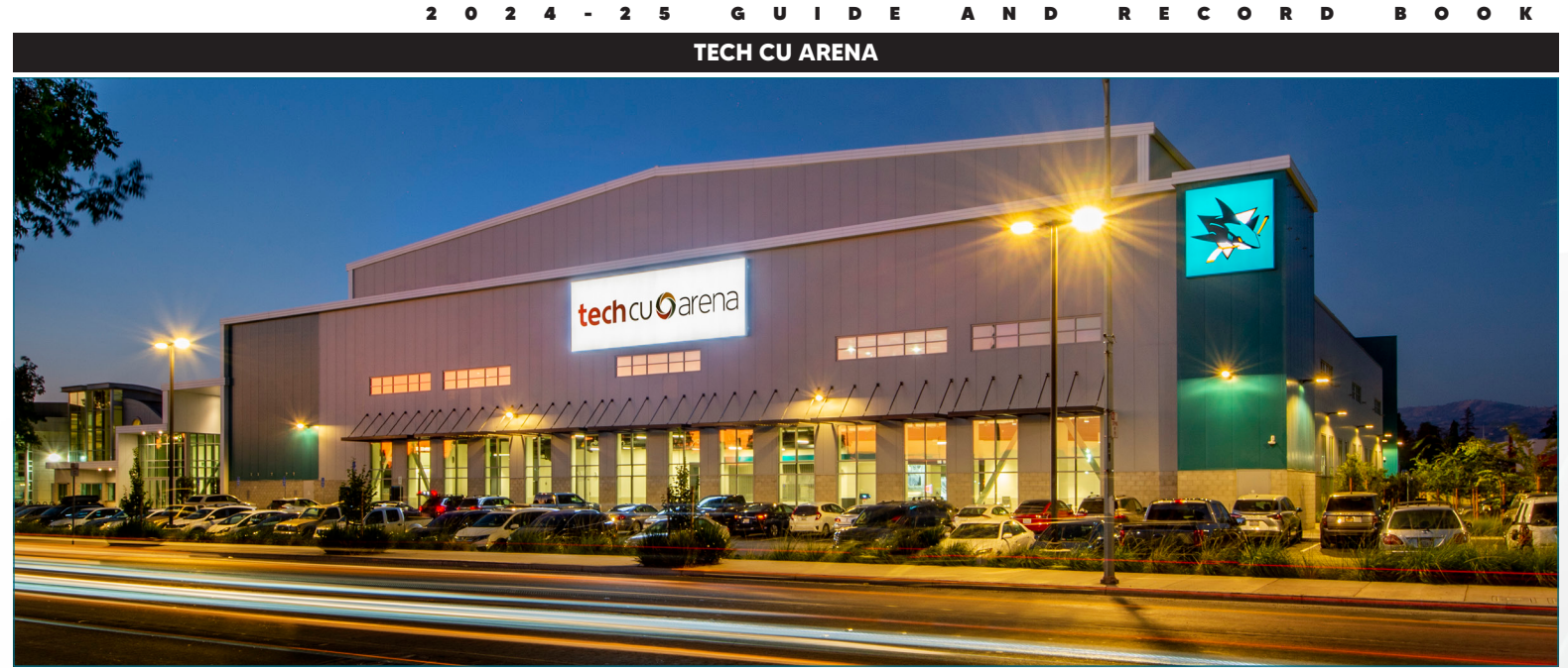
Tech CU Arena opened in August of 2022 and is the crown jewel of a 200,000 square foot expansion of the Sharks Ice at San Jose public skating facility.

Tech CU Arena has a capacity of 4,200 and included training facilities and executive office space for the Barracuda, an in-arena video board and LED display, 12 premium suites, eight loge boxes, one theatre suite, a 46-person party deck, three bar locations including one at ice level, seven food concession stations, a press room and press box and two team merchandise stores.